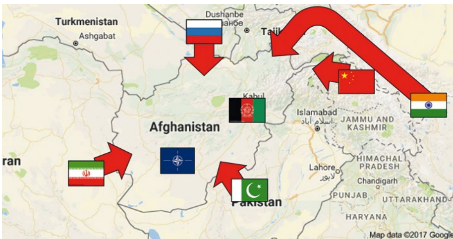
Fig. 1. Geographical Map of Afghanistan [2].

For China, the importance of Afghanistan becomes evident from the internal security in Xinjiang region. There are claims of links between Al Qaeda and Xinjiang Islamic terrorist organizations. For Iran, Afghanistan is important, it would like to see it free from US. Russia worry about the inflow of opium and other narcotics from Afghanistan to the central Asia [5].